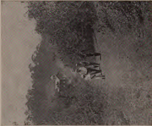
Mounting to Fort Lorenzo